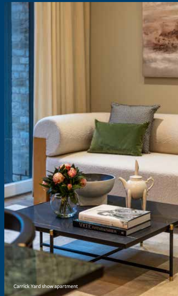
Carrick Yard show apartment